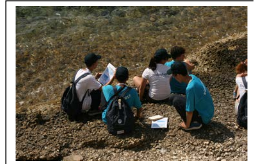
A group of students carrying out the International Team Field Investigation as part of IESO 2017 in France.