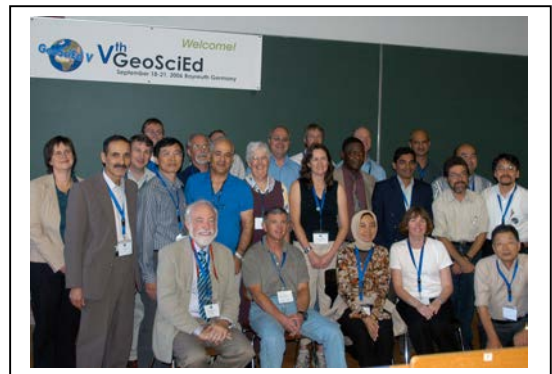
GeoSciEd V delegates.