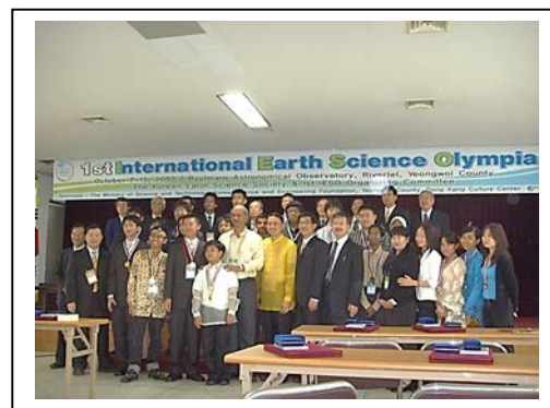
Medal winners at the 1 st IESO in South Korea.