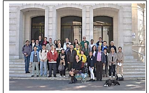
Mentors and Observers at the 6 th IESO, 2012