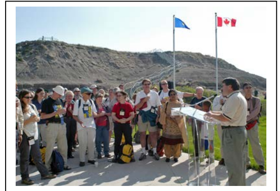
GeoSciEd IV delegates at the Royal Tyrrell Museum of Paleontology, Drumheller, Alberta.