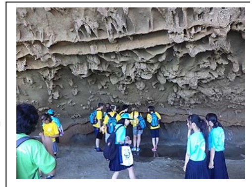
A multinational group of students carrying out the International Team Field Investigations (ITFI) during the 10 th IESO, Mie, Japan.