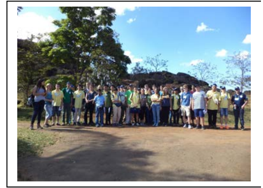
Group photo of students during the ITFI, 9 th IESO in Pocos de Caldas, Brazil.