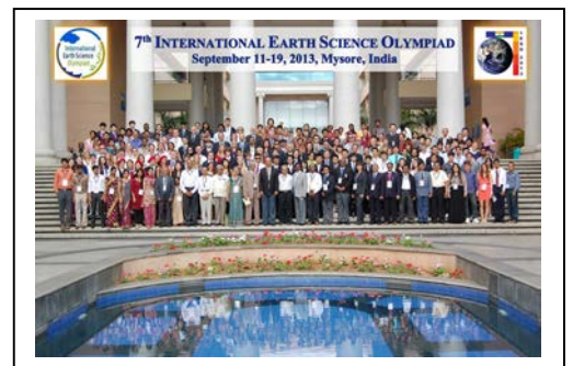
Mentors, Observers and Students at the 7 th IESO in Mysuru, India.