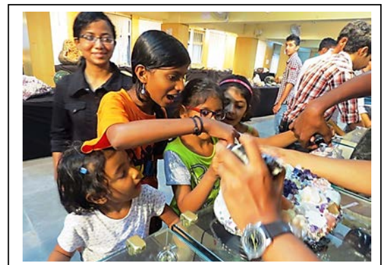
School students excitedly learning about minerals and rocks at the Earth Science Exhibition, Bengaluru, India, 2015 linked to the teacher workshops (left) and Pune, India, 2016 (right).