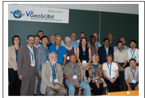
GeoSciEd V delegates.