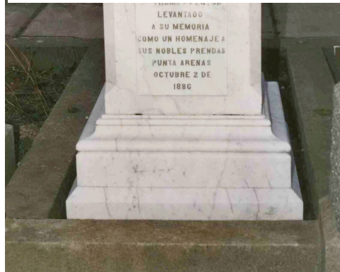
On this west-facing side, the marble has been weathered by 2mm compared to the lead lettering.