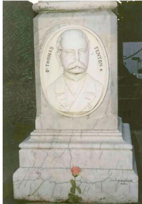
Marble gravestone in Punta Arenas, Chile. This east-facing side is in good condition.