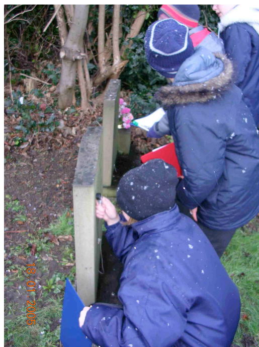
Pupils studying gravestones closely (in a snow flurry!)

Then, allocate small groups of pupils to a row of graves per group and ask them to survey each grave and to record their findings on their sheets. Give them a time and place to meet when they have finished their survey and ensure each cluster of small groups is supervised by an adult. Afterwards, count heads and return safely to school!