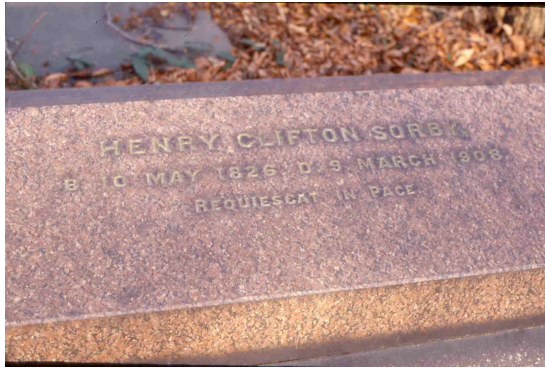
Red granite, used for the grave of a famous geologist in Sheffield, Ecclesall Churchyard, Sheffield