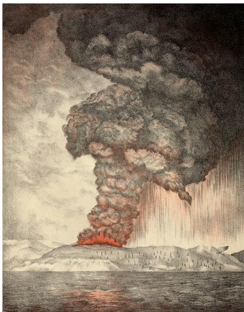
The eruption of Krakatoa in 1883, drawn BEFORE the big eruption.

This image is in the public domain because its copyright has expired.