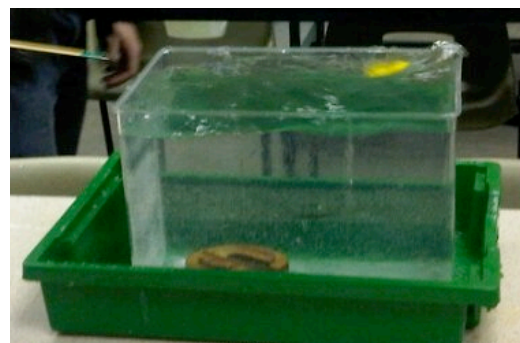
The 'Krakatoa tank' creating tsunamis.