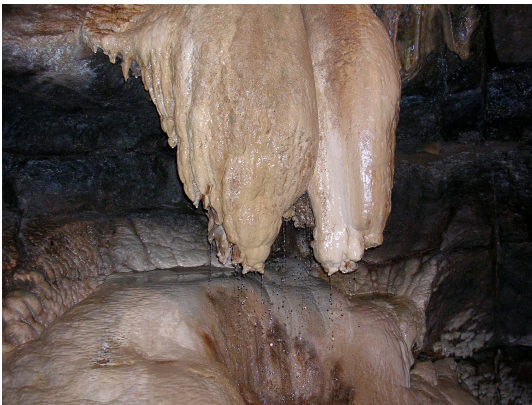
"Queen Victoria's bloomers" - Some fascinating shapes are formed underground as water trickles through the rock. (PK)