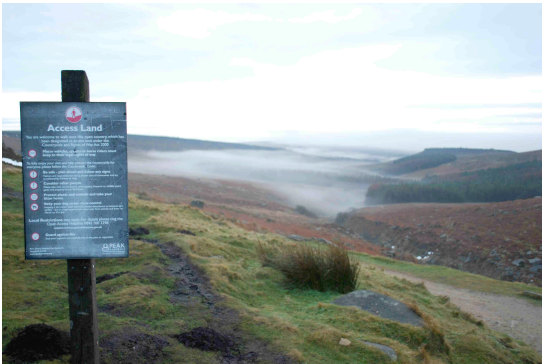
Misty moorland, with its vegetation of bracken, coarse grass and reeds (PK)