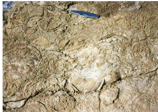
Limestone with shelly fossils