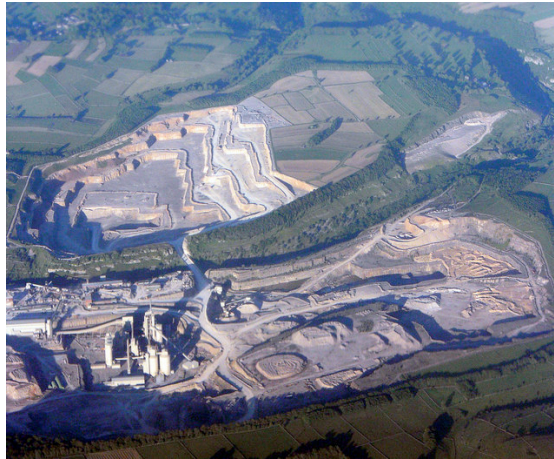
Quarrying – an important source of raw materials for the chemical industry