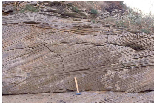
The curious lines in the rock show where ancient sand bars formed underwater, millions of years ago. (PK)