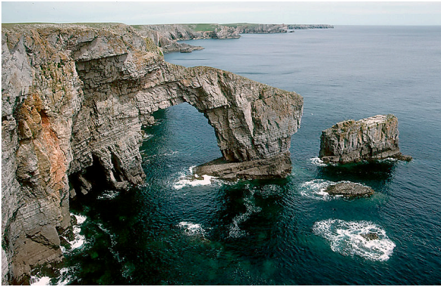
A spectacular coast