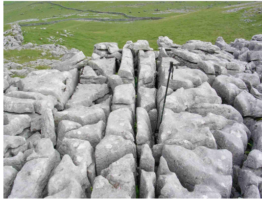
A natural "pavement" with cracks enlarged by weathering (PK)