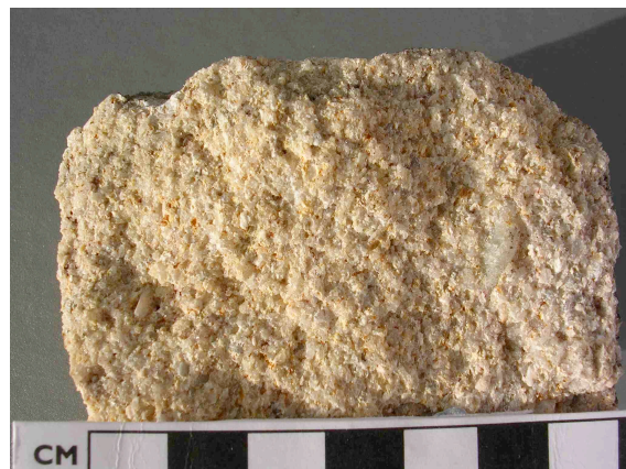
Coarse sandstone

Because of the differences, the landscape that develops on sandstone bedrock may be quite different from that formed on limestone. Study each postcard (see page 3). One shows landscapes that have developed on hard sandstones and the other on well-cemented limestones. Try to decide which is which and explain the reasons for your decision.