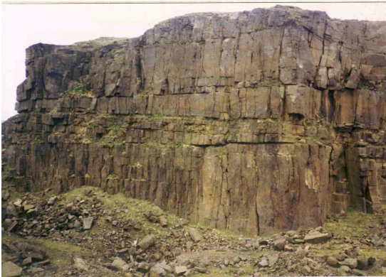
Stone from this quarry was used to build dams for reservoirs in the 1850s (PK)