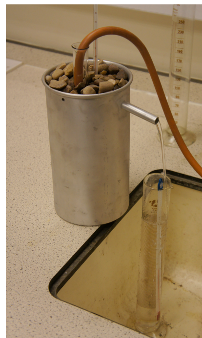
The geothermal power model 'in action'

Finally, discuss the proposition, found in many science textbooks, that 'geothermal energy is renewable'.