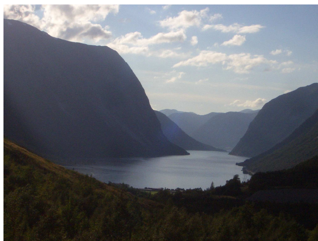
View of Geiranger Fjord, Norway