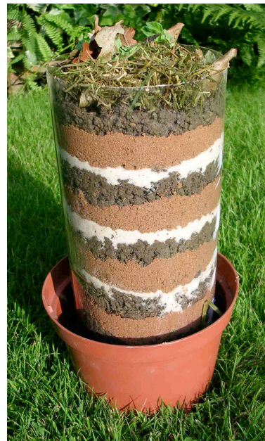
A 'Do-it-Yourself' wormery.

Try building your own wormery like this one: