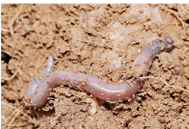
A close up image of an earthworm.

Permission is granted to copy, distribute and/or modify this document under the terms of the GNU Free Documentation license.