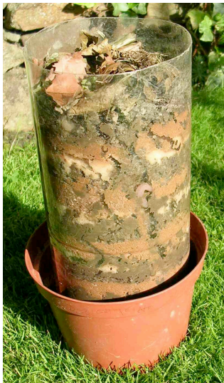
The 'Do-it-Yourself' wormery after 6 days.

Context: Pupils are asked to think through how soil forms, as Darwin did in the 1830s, then to suggest how he could have tested his ideas. They then are invited to either build their own wormery or observe one that a teacher has built. Our wormery developed as follows over several days.