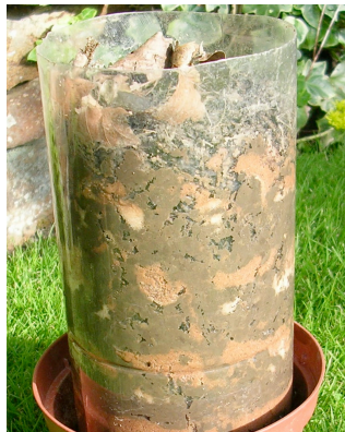
The 'Do-it-Yourself' wormery after 15 days.

Following up the activity: Try investigating the conditions that worms like best by making several wormeries with different layers of sand, soil, chalk, organic material (grass, leaves, vegetable peelings, etc.) to see how the action of the worms affects the layers.