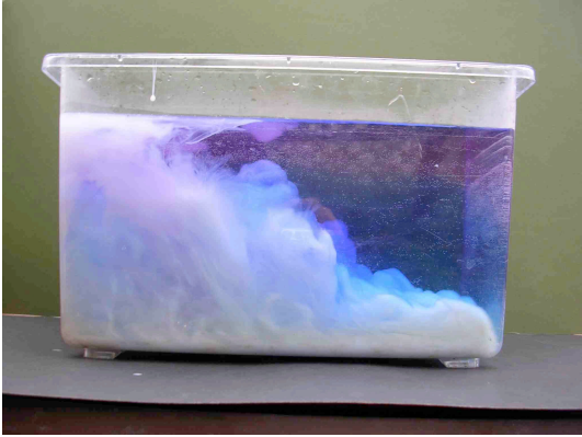
The tank in action

Topic: A demonstration of how density currents flow in a tank of water, used as an analogy to the oceans and atmosphere.