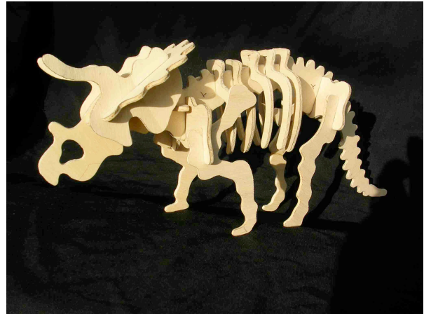
A reconstructed Triceratops model

When the pupils have finished, they should see if they can reconstruct the dinosaur (or chicken!).