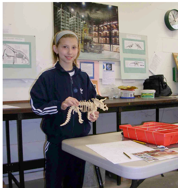
The reconstructed skeleton proudly displayed