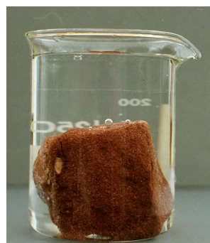
Bubbles from a sandstone

They should realise that: most of the bubbles rise from the top of the rock; they do this because the air in the spaces (pores) in the rock rises, allowing water to flow into the bottom; this shows that the rock is quite porous and that the spaces are connected (the rock is permeable). The granite has no connected spaces, so air and water cannot flow through.