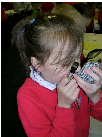
Looking hard at the 'bits' in a rock

Bit clues. Explain that the 'bits' are called grains. Then repeat this activity asking the pupils to describe some of the grains to each other. Common properties of the grains that they describe will be their: colour, shape, size and surface shininess (lustre).