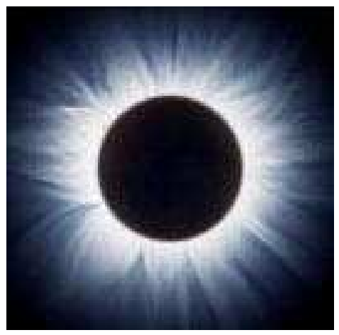
Solar eclipse

This activity demonstrates how a small object, which is near, can block out the view of a much larger one that is further away. Do you think the Sun and the Moon often appear to be the same size in the sky? In fact, they are not the same size at all and yet the Moon can block out the Sun completely, so that it goes quite dark. This is called a total eclipse of the Sun (or a solar eclipse).