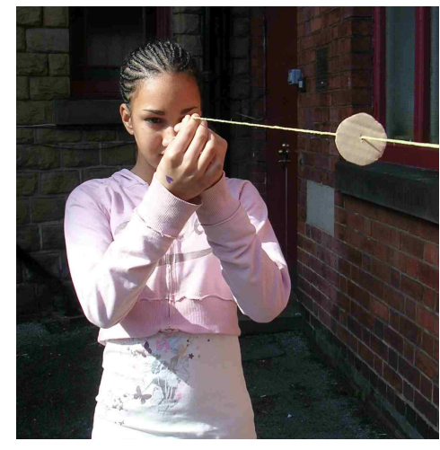
Using the 'Moon' to block out the 'Sun'

Answers: somebody's head; your thumb; your eye.